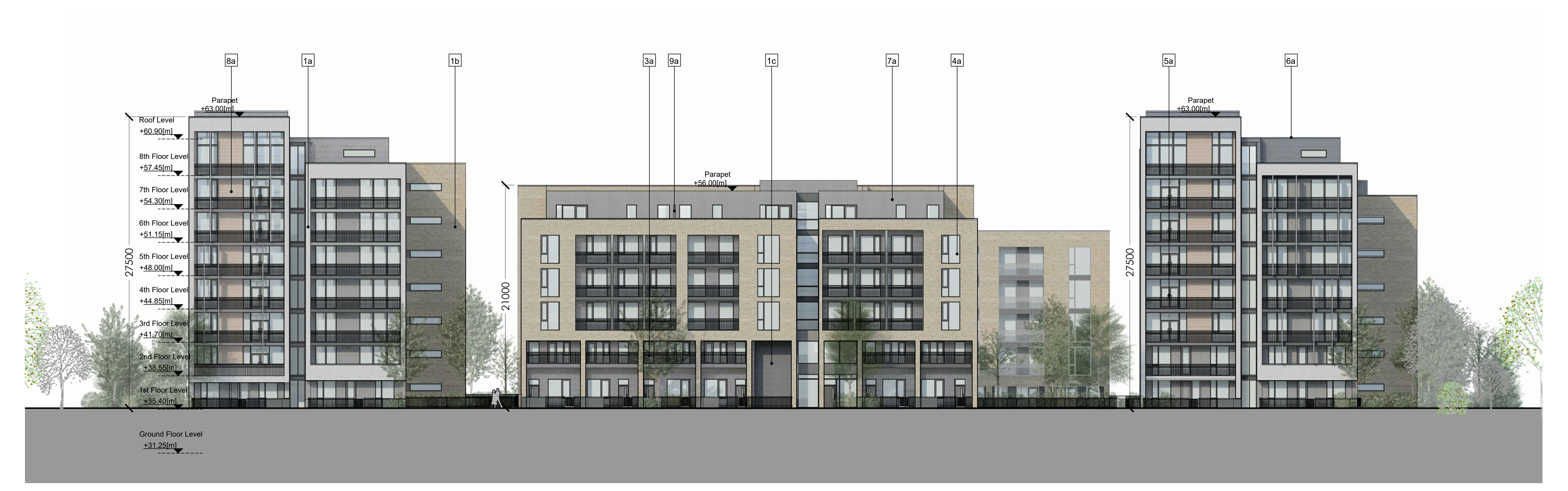
03 - South Elevation - Block 4 Scale 1:200 @A0