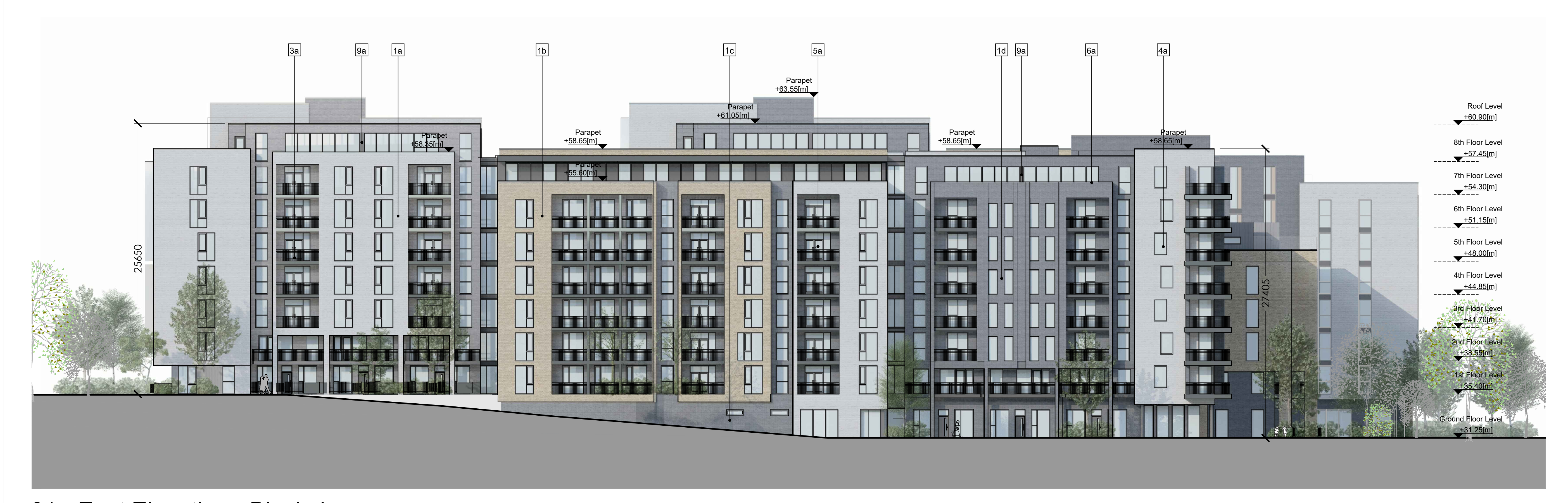
01 - East Elevation - Block 4 Scale 1:200 @A0