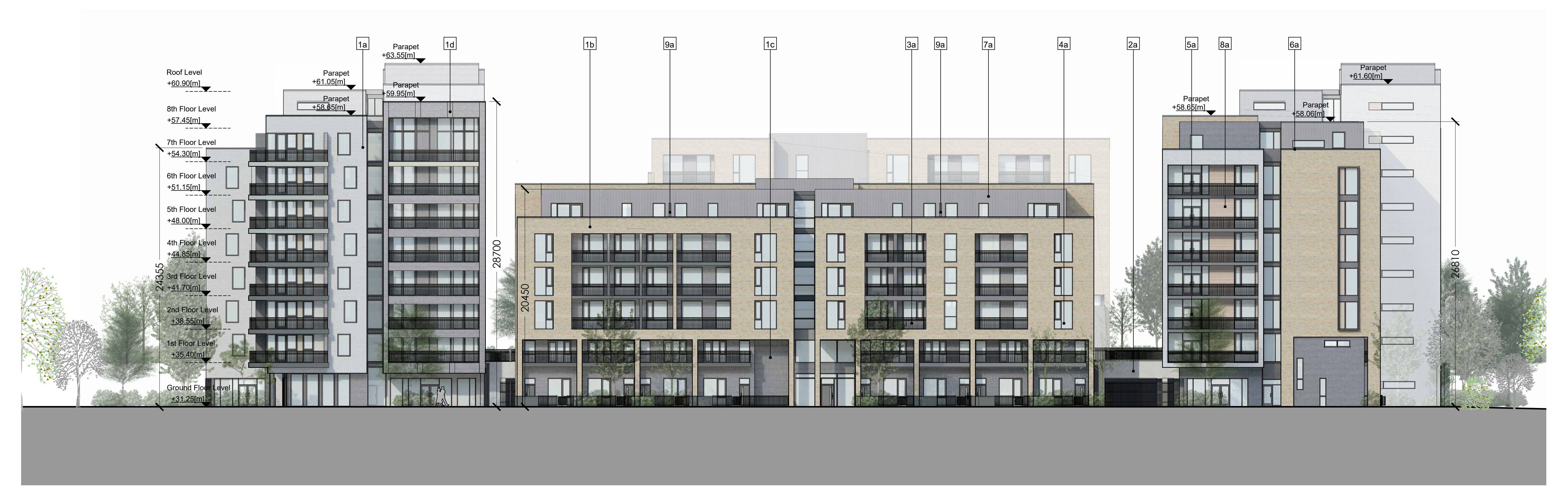
02 - North Elevation - Block 4 Scale 1:200 @A0